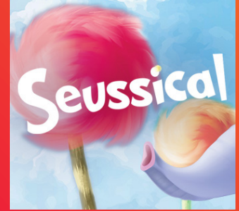
July 30 - Aug 4 Byham Theater