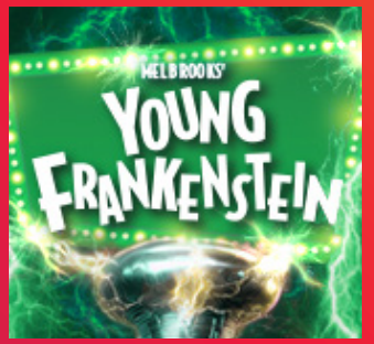
July 19 - Sept 1 Greer Cabaret Theater