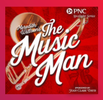
July 9 - 14 Benedum Center