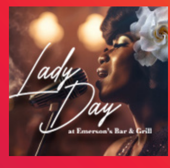
May 17 - June 30 Greer Cabaret Theater