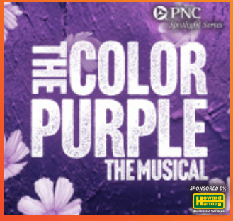
June 25 - 30 Benedum Center