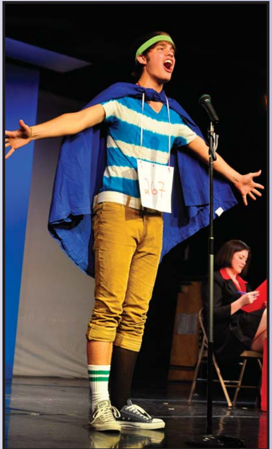
2010 Musical Theater Workshop Performance of The 25th Annual Putnam County Spelling Bee.

Call 412-281-2234 Enroll Online! pittsburghCLO.org