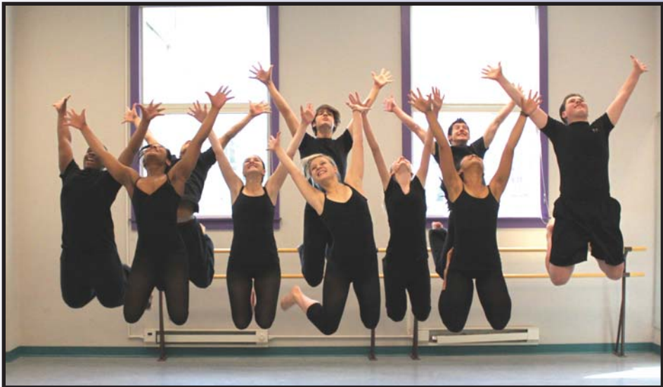
Students in the Pre-Professional School

Call 412-281-2234 Enroll Online! pittsburghCLO.org