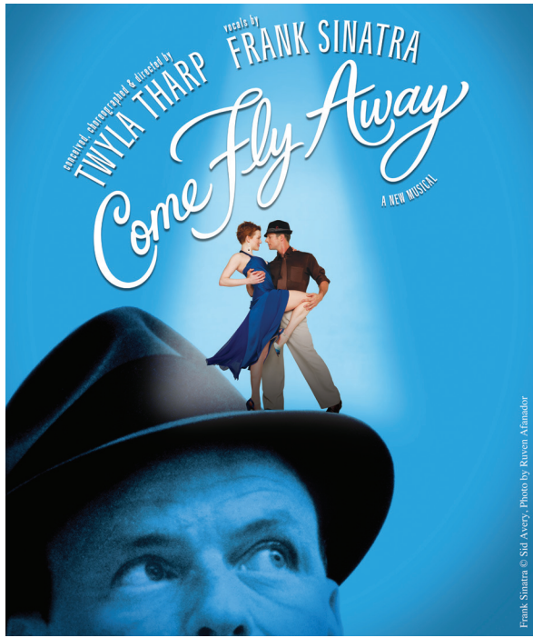
Frank Sinatra © Sid Avery, Photo by Raven Afanador